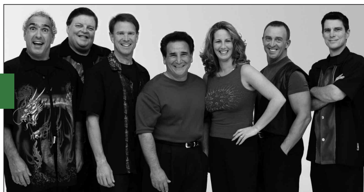
The Fabulous Greaseband