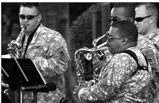
63rd Army Band