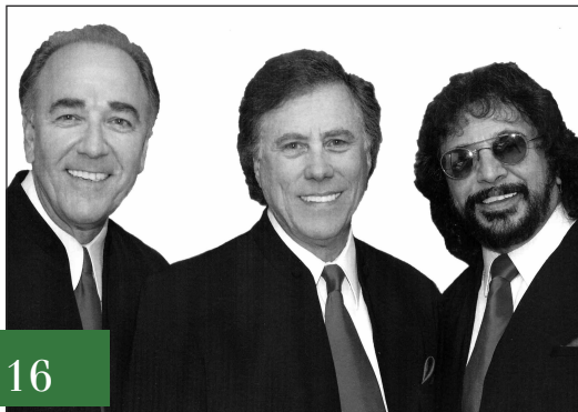
The Happening sponsored by Comcast